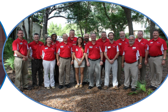
Georgia TSA 13-14 Board of Directors