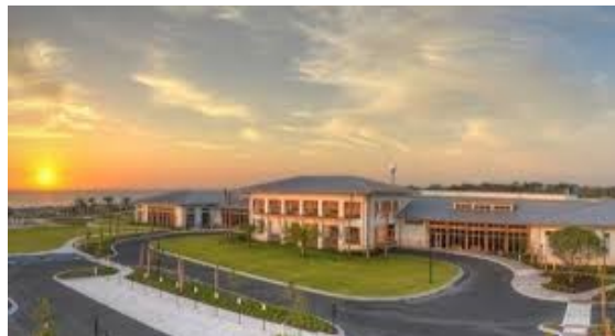
Jekyll Island Conference Cen-